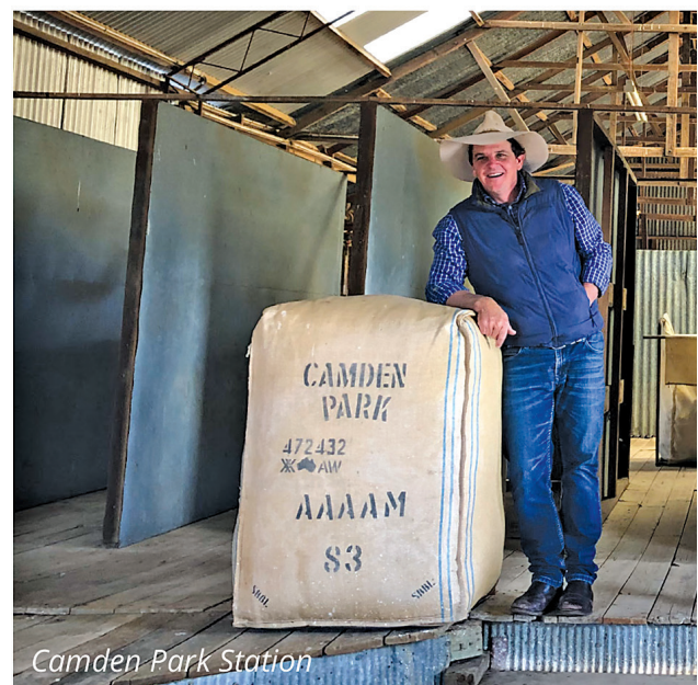
Camden Park Station