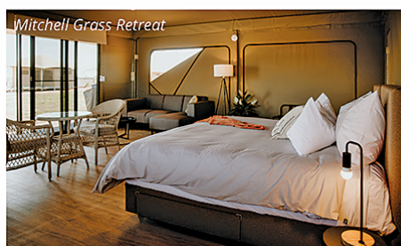
Mitchell Grass Retreat