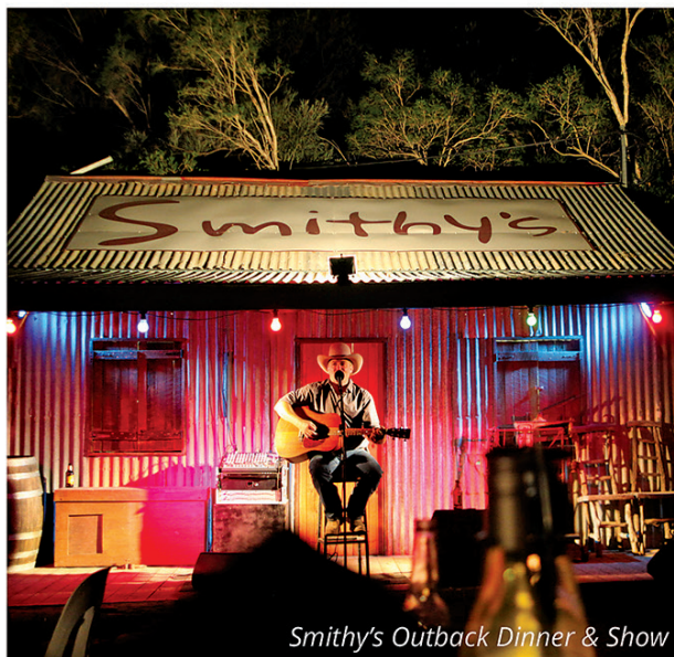
Smithy's Outback Dinner & Show