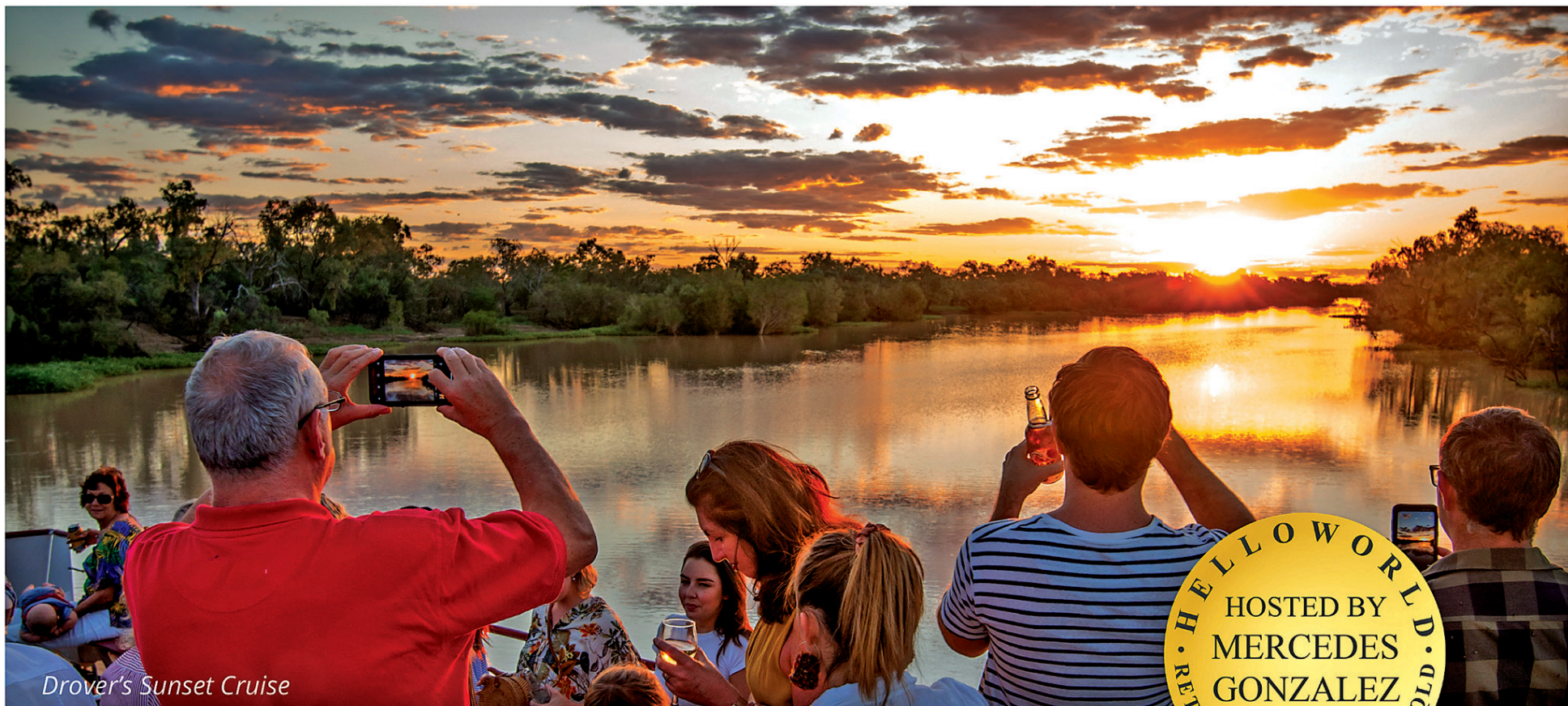
Drover's Sunset Cruise